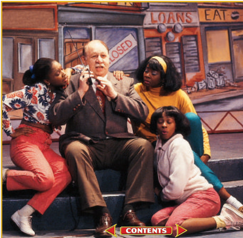
Little Shop of Horrors , a situation-centered play, demonstrates how different personalities respond to a single situation.

The situation-centered approach typically takes a single situation and places a number of characters in the situation to demon-