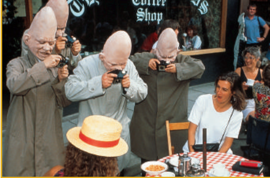
Group improvisations, such as this skit in which Conehead tourists photograph restaurant patrons, require coordination as well as spontaneity.